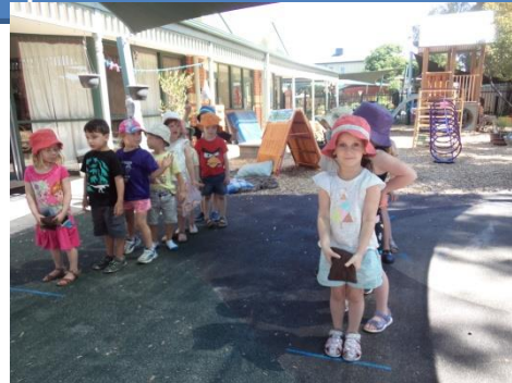
Examining 'contents' of the icy planet Neptune and relay races – throwing the 'core' (beanbag) into Neptune (hoola hoop)!