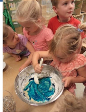
Cooking Neptune pancakes – the chocolate chips in the middle as the core of the planet!